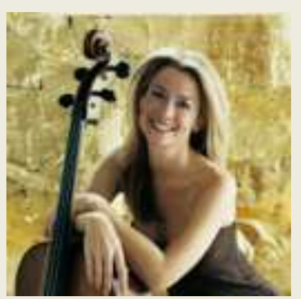
Dreaming by Sara Sant'Ambrogio [CD album]

Purchase from Amazon <a href="http://www.sarasantambrogio.com/Sara">http://www.sarasantambrogio.com/Sara</a> Store.html