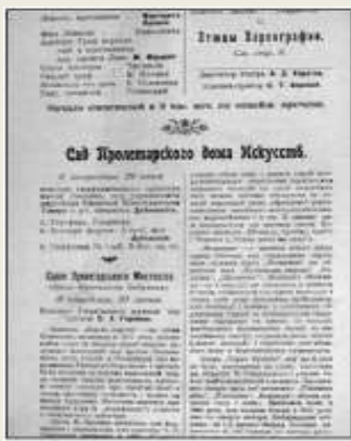
A page from the magazine "Muzychny Visnyk" with a preview of M. Lysenko State Symphony Orchestra's concert (1919 p.)

After the establishment of the Soviet power, the Orchestra was funded from the budget of the People's Commissariat (Soviet Ministry) of Education and it continued its performances as Republican Symphonic Orchestra named after M. Lysenko. During short period of its independent existence the musicians took part in four musical meetings devoted to J. Bach, prepared six programs made up of P. Tchaikovsky's works. In April 1919 were held author's concerts of R. Gliere and O. Skryabin. Simultaneously continued symphonic meetings at the summer bandstand of Proletarsky Park in Kiev.