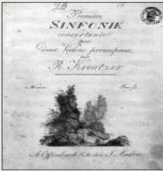
Title page of a musical edition from the library of Kiev City Capellia