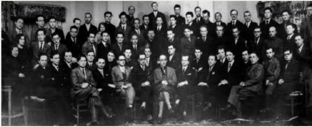
Newly formed State Symphony Orchestra of Ukraine with conductor Herman Adler (in center, 1937 p.)

First critical reviews of the orchestra's activity were positive: "Not only is the orchestra itself new, 80 percent of its members are also young musicians... Youth is always associated with unstoppable, indefatigable energy, and that is a guarantee of fruitfulness." The conductor was also noted by the press as "a musician of great culture and experience, possessing artistic style and tact, fortitude, strict but not dry performance" (Proletarska Pravda, 1932, 30th of October).