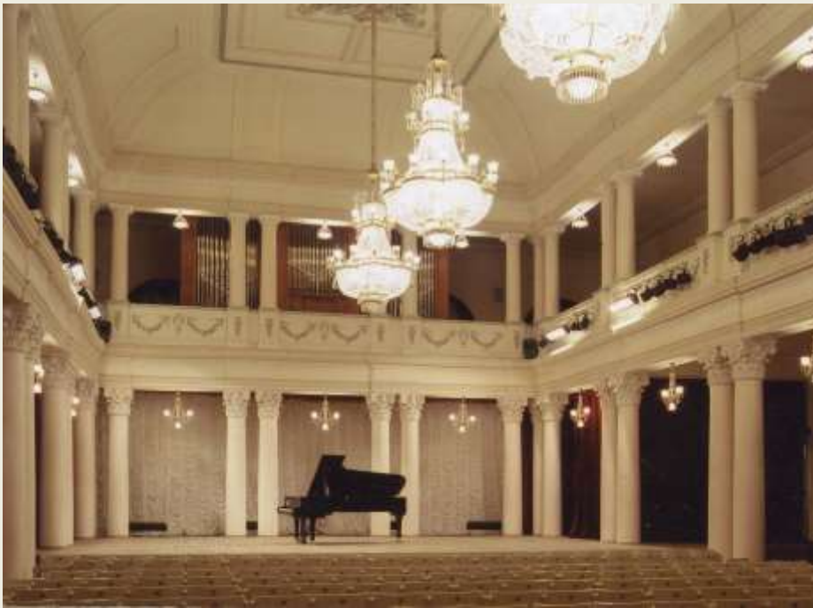
Lysenko Concert Hall in Kiev, permanent home of the National Symphony Orchestra of Ukraine