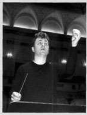
Conductor Volodymyr Sirenko

At the end of 1997 the National Honored Academic Orchestra of Ukraine was headed by Ivan Hamkalo, an Honored Artist of Ukraine, skilled maestro, encyclopedic expert of the music.