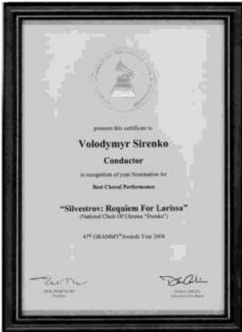
Diploma with the 47th Grammy nomination for Valentin Silverstrov's "Requiem for Larisa" performed by the National Symphony Orchestra and National Choir Ensemble "Dumka"