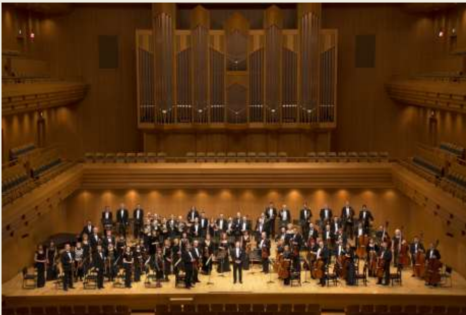
NSOU at Tokyo Opera City, Japan, November 15, 2014

Price Rubin & Partners Toll Free: 866-PRI-RUBI (774-7824) ext. 1 LA: 310-254-7149 Skype: pricerubent