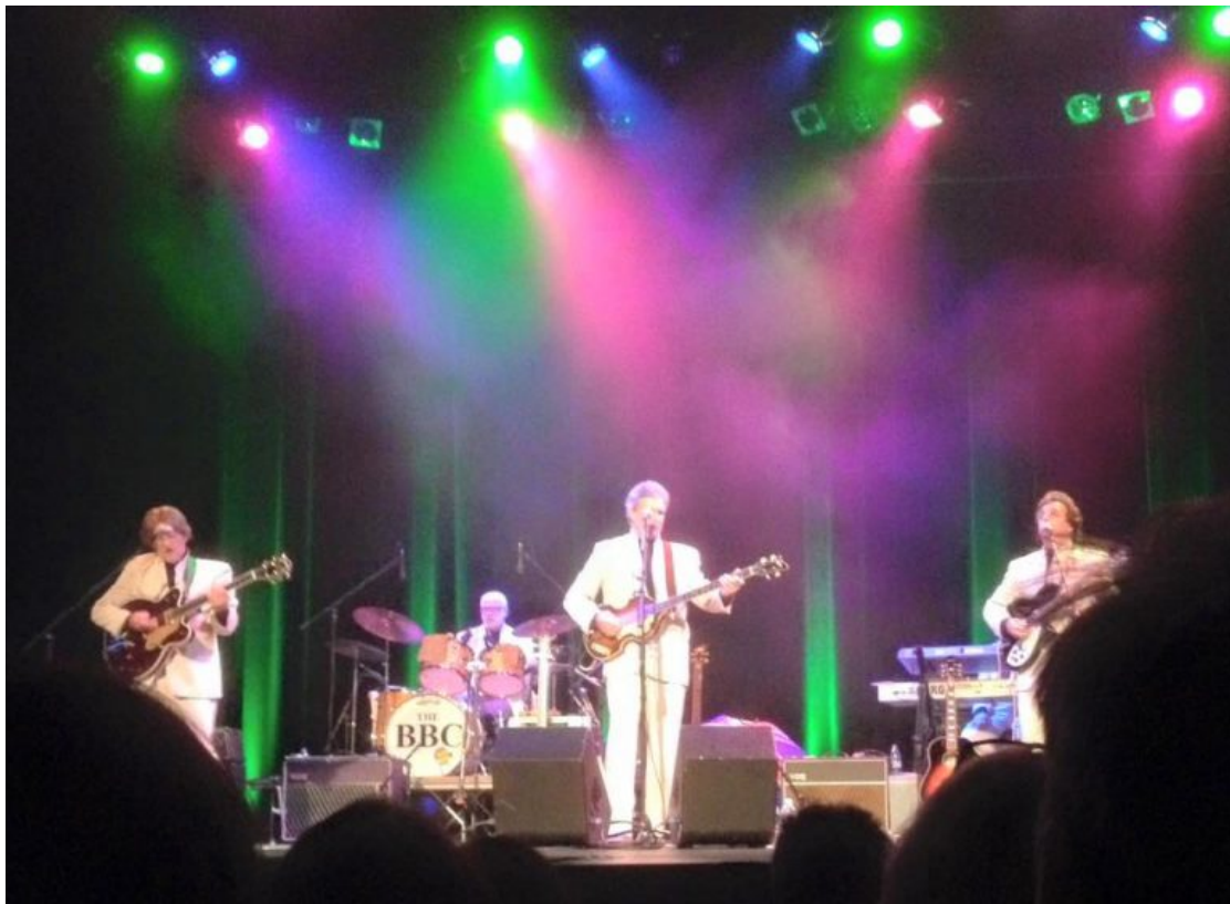
The BBC band will be appearing in Liverpool in tribute to the Beatles.